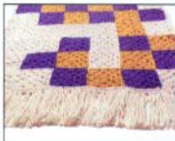
62 Not Your Granny's Rug