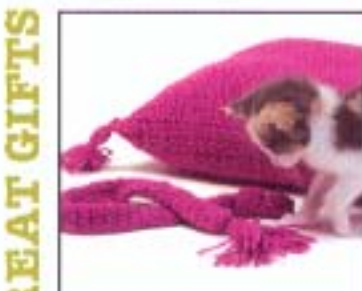
78 Kitty Cushion & Toy