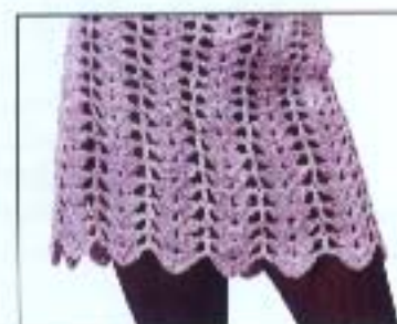
49 Lacy Wrap Overskirt