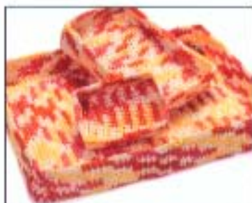
65 Get Organized Storage Baskets