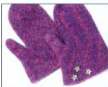
87 Felted Oven Mitts