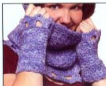
36 Classic Neck & Wrist Warmers