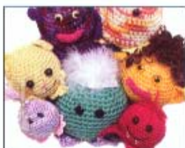
84 Cute Crochet Critters