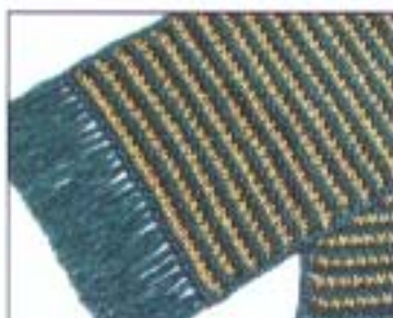
71 Table Runner & Place Mats