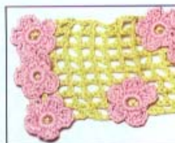
43 Feminine Floral Scarf