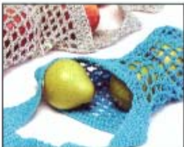
56 Shaped Market Bag