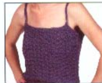
46 Strappy Cami