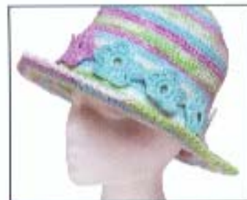
39 Beautiful Brimmed Hat