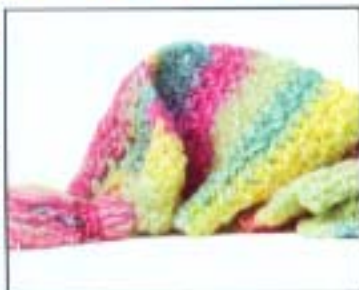
30 Simply Soft Scarf