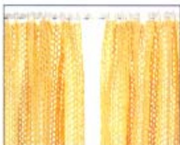
68 Lacy Café Curtains