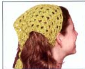
33 Chic Kerchief