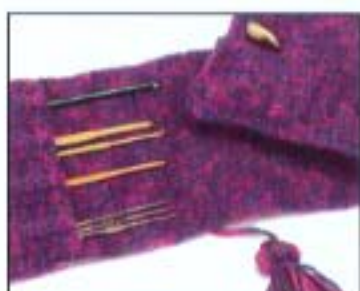
90 Felted Hook Book