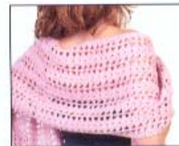
52 Wrap Around Shawl