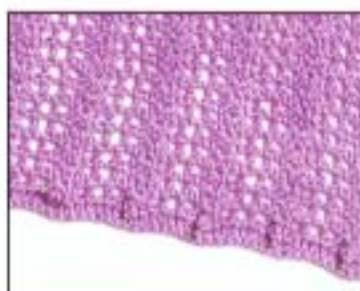
81 Beginner Baby Blanket