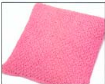
59 Casual Cushion